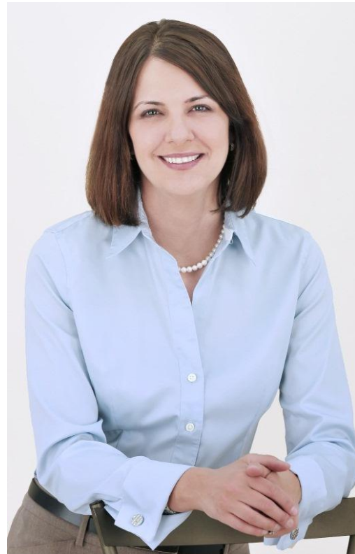
Keynote Speaker Ms. Danielle Smith Leader, Wildrose Party

62 nd Annual Luncheon Friday March 9 th , 2012 Calgary TELUS Convention Centre Macleod Halls